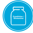
Creatinine / Glutamine